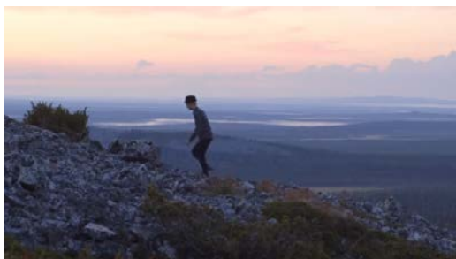
Figure 3 Film and television ensemble

In the laying of the story context, with a good narrative rhythm can directly show the vividness and image of the story, give the story a more diversified development form, but also give readers more profound emotional resonance, enhance the readability of vocal ensemble. The author grasps the structure and form of the narration of vocal music, can give another unique form to the plot operation of vocal music, and give the narration more powerful strength and direction. In addition, Milan Kundera, a famous writer, believes that every chapter of vocal music can be regarded as a chapter in music, which can show the author's inner emotion and expression form, and can change the length and rhythm in the operation of the rhythm, and then show the different forms and needs of the article in different stages, and give readers different psychological feelings, thus making the narrative song have a sense of rhythm. At the same time , " the sky of fantasy "vocal music set is also applied to the present film and television works, as shown in figure 3 for the film and television series.