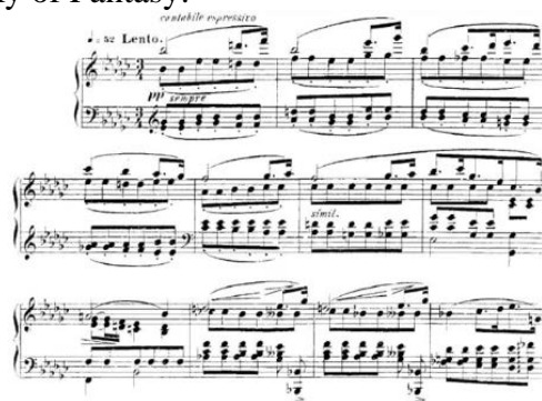
Figure 2 Sound spectrum of the sky of fantasy

Whether a musical work can be deeply rooted in the construction of music rhythm, music background, music theme and other related factors, the most important of which is the melody in music works, music works with a catchy rhythm can lay a solid foundation to be liked by the audience. For the vocal music set, the change of the melody can show the performance emotion of the vocal music set, and highlight the main atmosphere created by the works. The rhythms used in vocal ensembles break the barrier between languages, and even audiences in different countries can feel the plot transformation and intrinsic implication of vocal ensembles through different musical rhythms on the basis of unopened language barriers. The same applies to the choice and use of music. Pictured here is The Sky of Fantasy.